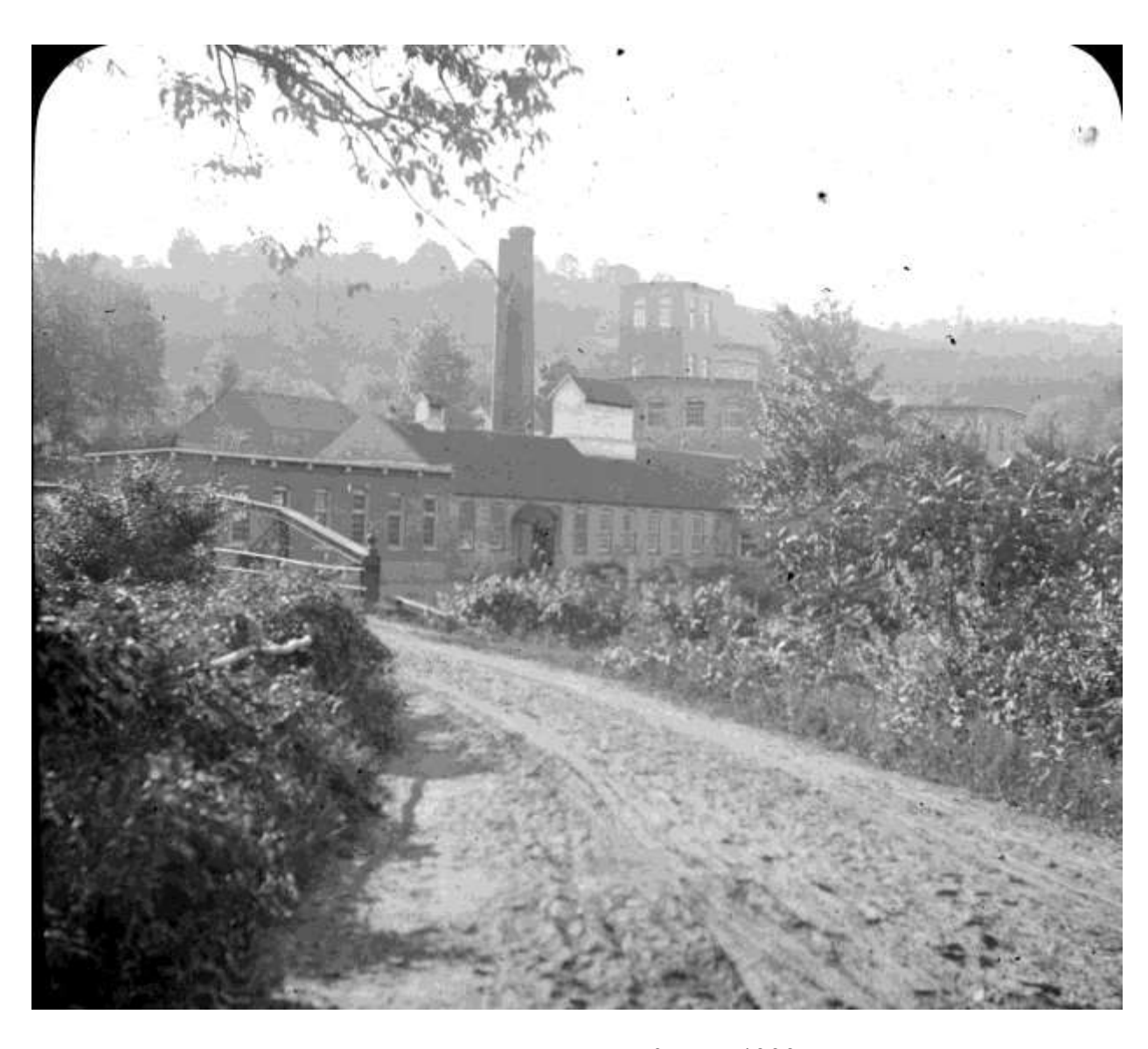
The Paper Mill at Bancroft circa 1900