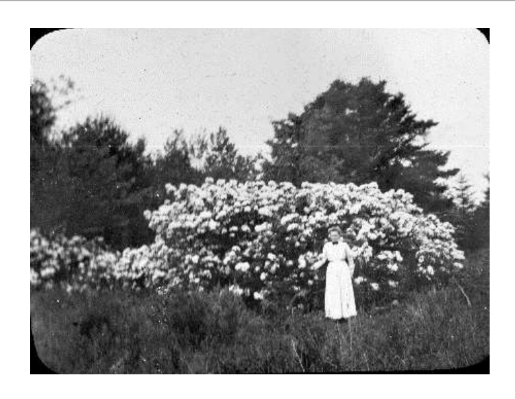
"Laurel at the New Cemetery" (from an early glass slide)